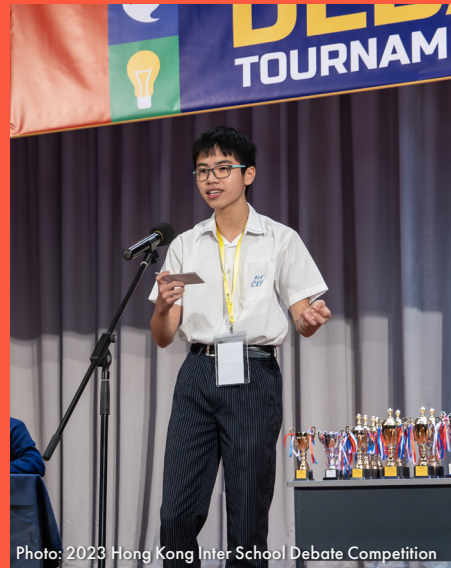
Photo: 2023 Hong Kong Inter School Debate Competition