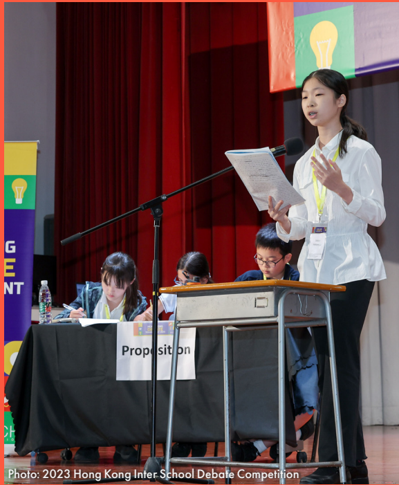
Photo: 2023 Hong Kong Inter-School Debate Competition